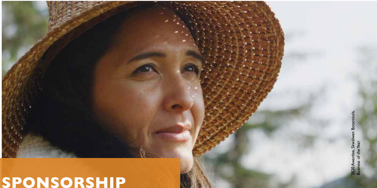
2020 Awardee, Shwáilwen Botanicals, Business of the Year