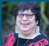
Judith Sayers, OC

It is important to highlight and celebrate the achievements of those that make our communities stronger. Humility and celebration are not mutually exclusive, nor necessarily conflicting. We have much to celebrate within our communities.