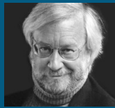
Scott McIntyre, CM, OBC

The citizens of BC deserve to be recognized and celebrated for their excellence and outstanding achievements. This makes BC not only proud, but stronger as a community.