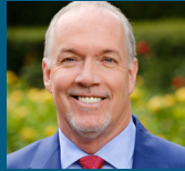
Hon. John Horgan, Premier

BC Achievement gives us the opportunity to recognize and celebrate the best and brightest in British Columbia. Honouring inspiring individuals for their contributions to our communities encourages others to step up and do the same. BC Achievement fosters a spirit of generosity and selflessness throughout our province.